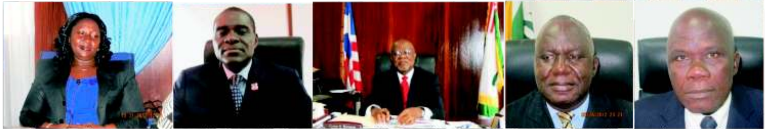
Supt. Elizabeth Dempster, Sen. Peter Coleman, Sen. Cletus S. Wotorson, Rep. George W. Blamoh, and Rep. Namene T.H. Bartekwa

Grand Kru County is a county in the southeastern portion of the West African nation of Liberia. One of 15 counties that comprise the first-level of administrative division in the nation, it has eighteen districts. Created in 1984, Barclayville serves as the capital with the area of the county measuring 3,895 square kilometers (1,504 sq mi). As of the 2008 Census, it had a population of 57,106, making it the least populous county in Liberia.