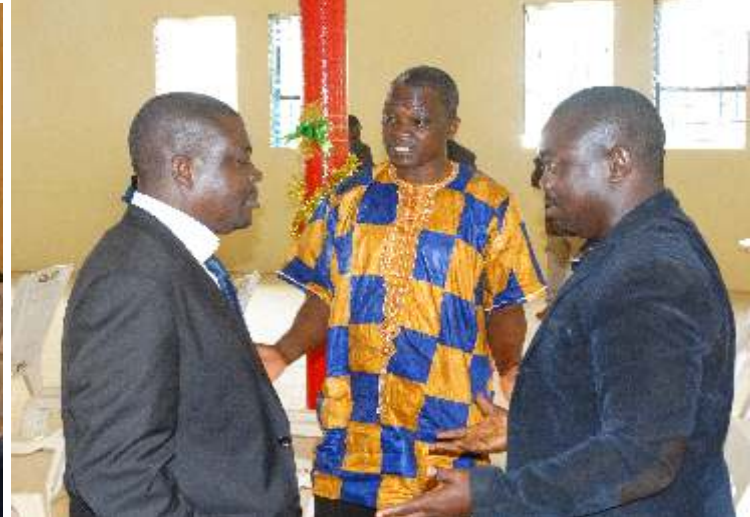
Some stakeholders chatting

According to the one of the graphs shown, Fish Town City in River Gee has a population of 3,328 and has no social or public services that qualifies it as a city, Cestos, in River Cess, has a population of 2,578. Bensonville or Bentol City in Montserrado