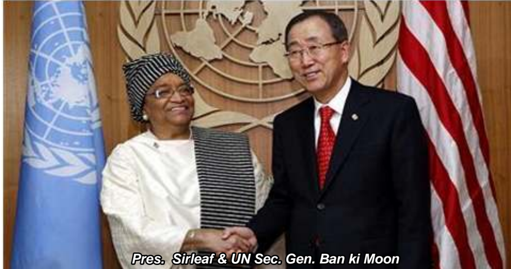
Pres. Sirleaf & UN Sec. Gen. Ban ki Moon

UNOPS has established and renovated offices to accommodate personnel