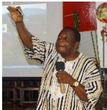
GC Comm. Weh-Dorliae