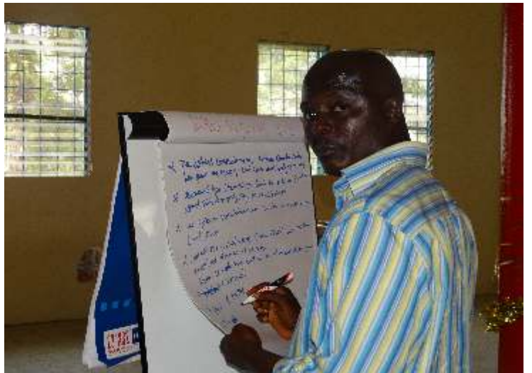
Note taker in action