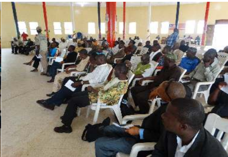
Stakeholders at the consultation in Buchanan