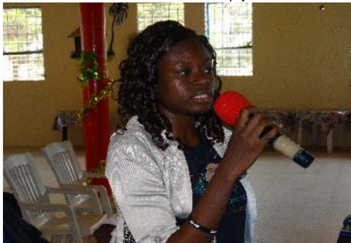
Female participant asks question